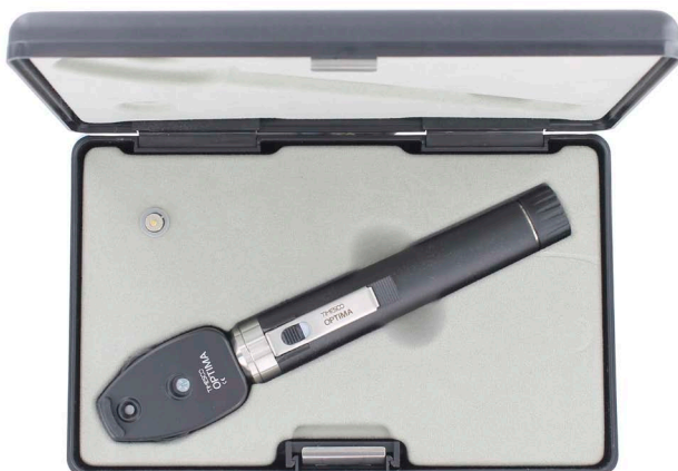
2505.250.50 Optima Pocket Ophthalmoscope In Hard Case with 2.5V Spare Bulb