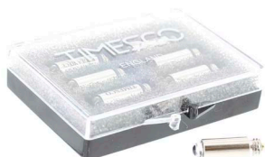
2505.325.10 Optima Pocket Otoscope Bulb Only, 2.5V Pack of 6