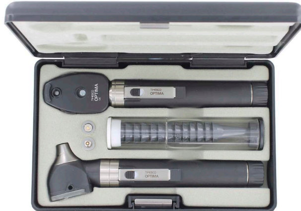
2505.275.75 Optima Pocket Diagnostic Set In Hard Case With 2.5V Spare Bulbs