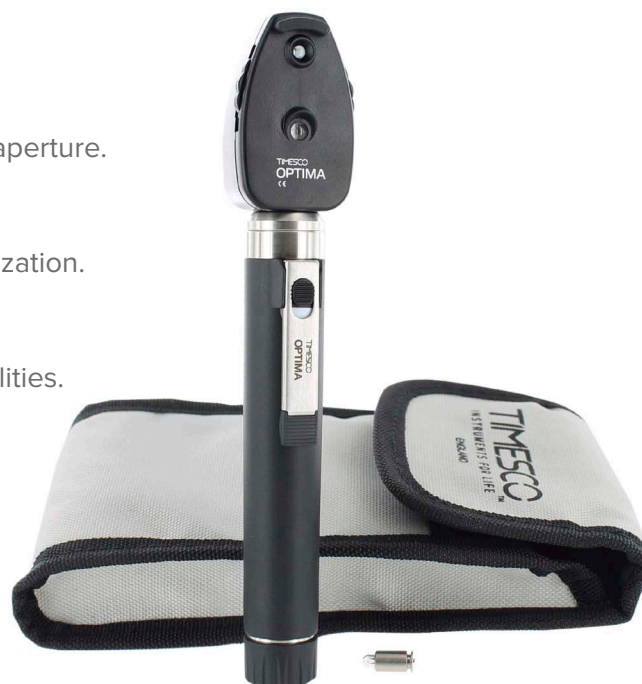
2505.250.25 Optima Pocket Ophthalmoscope In Pouch With 2.5V Spare Bulb

Optima Pocket diagnostic sets in soft pouches are available with and without spare bulbs to make these even less expensive.