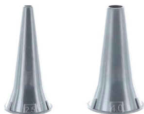
Optima Pocket Otoscope Speculums Disposable (2.5mm and 4.0mm)