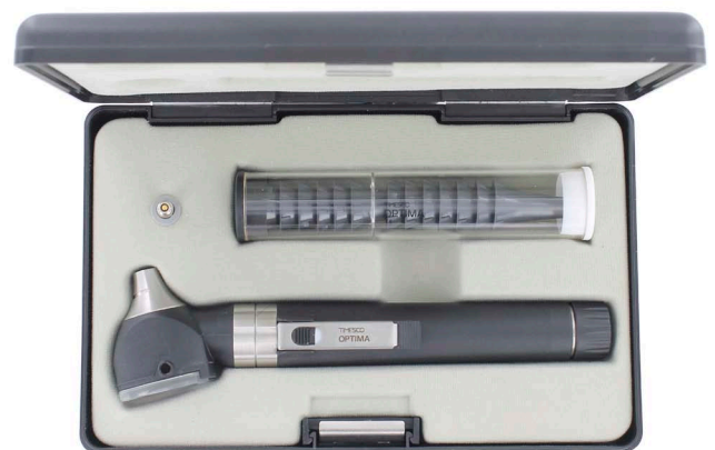
2505.260.50 Optima Pocket Oscope In Hard Case with 2.5V Spare Bulb