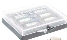
2505.325.20 Optima Pocket Ophthalmoscope Bulb Only, 2.5V Pack of 6