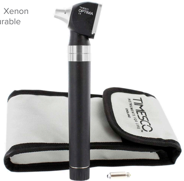
2505.100.25 Optima Pocket Oscope In Pouch With 2.5V Spare Bulb

Optima Pocket diagnostic sets in soft pouches are available with and without spare bulbs to make these even less expensive.