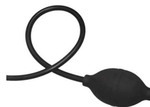
2505.950.50 Optima Insufflation Tube