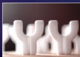
STANDARD DISPOSABLE MOUTHGUARD Permits Oxygenation of the patient while the guard is in place.