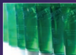
SIGNAL EEG GEL Supplied in boxes of 12x250ml tubes. Highly conductive multi-purpose electrolyte. This gel is water-soluble and non-staining.