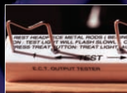
ECT OUTPUT TESTER A simple accessory allowing the user to verify the output prior to an ECT session.