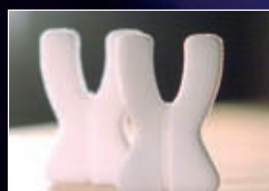
ORIGINAL DISPOSABLE MOUTHGUARD Permits Oxygenation of the patient while the guard is in place additionally allows the doctor superior control with larger grip and enhanced patient safety with 'anti-swallow' protection.