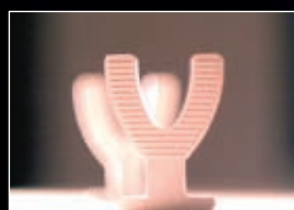
RUBBER HORSESHOE MOUTHGUARD Permits Oxygenation of the patient while the guard is in place additionally allows the doctor superior control with larger grip and is also reusable.