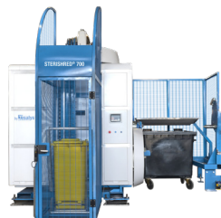
STERISHRED® 700 60-100 kg/h