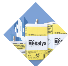
TESABOX cardboard containers for biohazardous waste