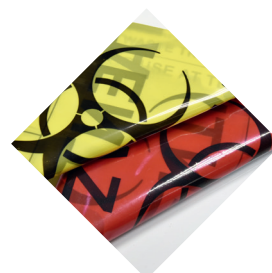
TESABAG « biohazard » autoclavable bags