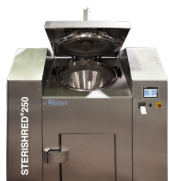
STERISHRED® 250 20-35 kg/h