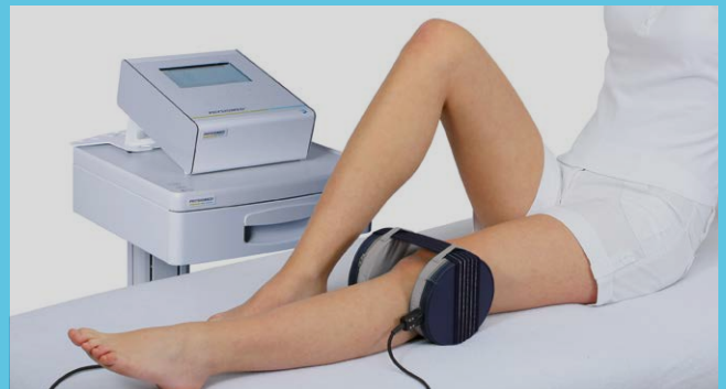
Magnetotherapy with set of applicators