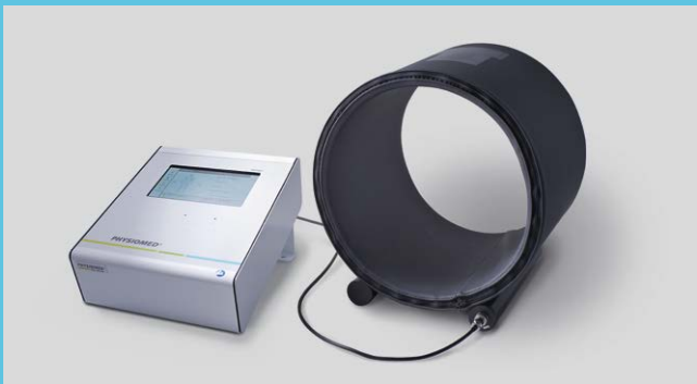
Cylinder, Ø 30 cm for magnetic field therapy of the limbs and head

MAG-Expert with anthrazit Coil Ø 60 cm integrated in a therapy couch – pillow included – for magnetic field therapy of the spine, pelvis and the whole body