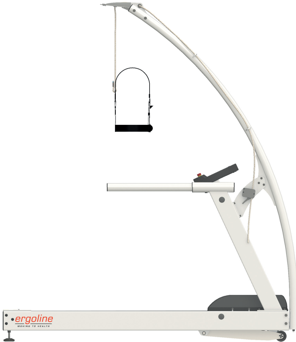
The figure could show not selected options and equipment ranges.