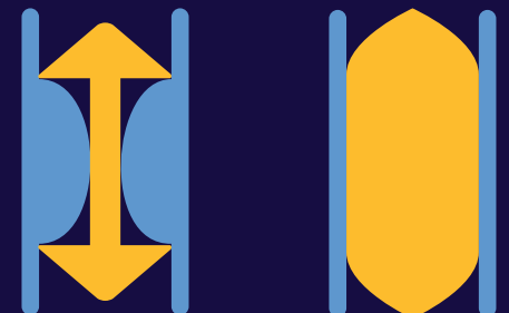
controlled radial dilation